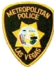
LVMPD Uniform Patch